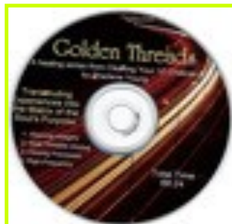
Golden Threads CD

An experiential imagery that connects you to the light held in your body and energy levels, which is your scared space, releases youthing chemicals and promotes PH balance. The process script unplugs the electrical energy circuits of unwanted patterns and core beliefs held in your system.