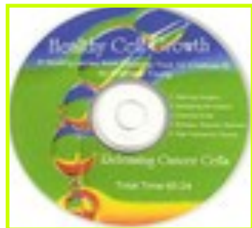
Processing CD's to Release and Retrain

The process script utilizes medical terminology, emotions, beliefs and patterns to release the creation of the unhealthy cell growth. Reframing and resolving the exact conflict that created the original pattern activates and creates a matrix shift in the DNA / RNA for a new blueprint of healthy cell growth for the body to now follow.